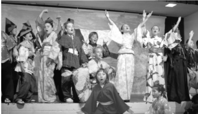
Top: Aina Haina students in full costume for their production of The Mikado

Last year opera was heard at a number of elementary schools around Oahu. The professionals at Hawaii Opera Theatre worked with five Oahu DOE schools that participated in the company's HOT Opera residency program. At its most basic, the program turns a population identified by the school into a mini opera company. The residency works a bit differently at each school